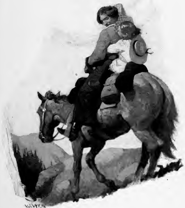
JERRINE WAS ALWAYS SUCH A DEAR LITTLE PAL